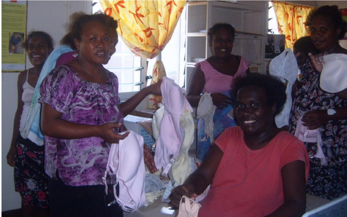
Special Care Nursery Ward – Post natal mothers.